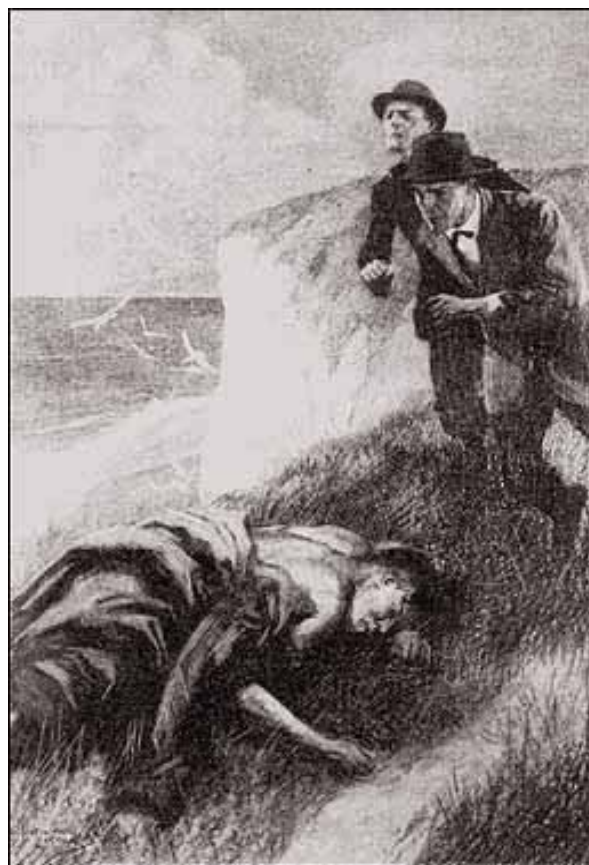
Fitzroy McPherson was the science master, a fine upstanding young fellow whose life had

"At your old tricks again," he laughed, patting his bulging pocket. "Yes. McPherson started early, and I expect I may find him there."