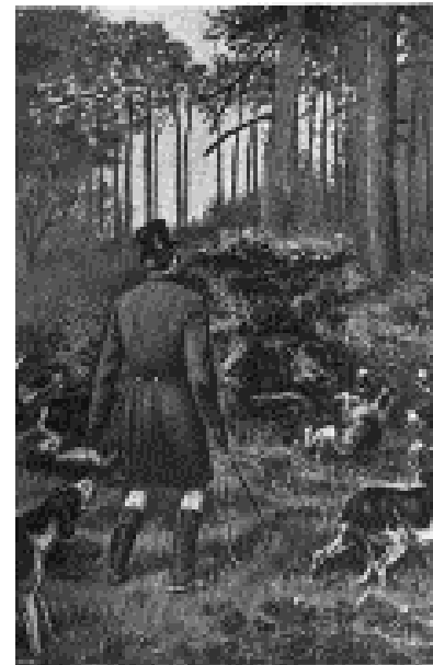
"A creature that was seen by the 'hounds'."

"'Well, my dear boy, if you will stick to that it may prove a blessing in disguise. But the difficulty in this case is to know where fact ends and fancy begins. You see, it is not as if there was only one delusion. There have been several. The dead dogs, for example, must have been one as well as the creature in the bush.'