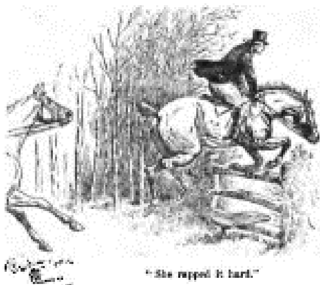
"She repped it hard!"

"There was a drive through the pine-wood—one of those green, slightly rutted drives where a horse can get the last yard out of itself, for