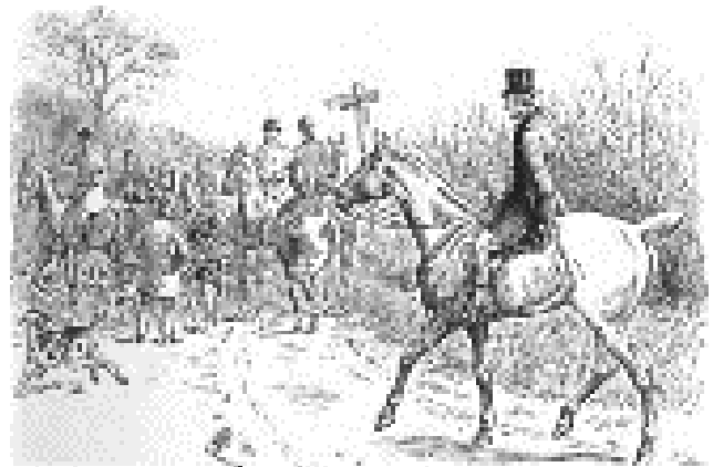
"As he rode by the hounds were thrown off."

"Young Wat Danbury rose and dressed and moped about the room feeling very miserable and unstrung, with a vision of the County Asylum for ever in his mind. He had the doctor's word for it if he could get through to evening in safety he would be all right; but it is not very exhilarating to be waiting for symptoms, and to keep on glancing at your bootjack to see whether it is still a bootjack or whether it has begun to develop antennae and legs. At last he could stand it no longer, and an overpowering longing for the