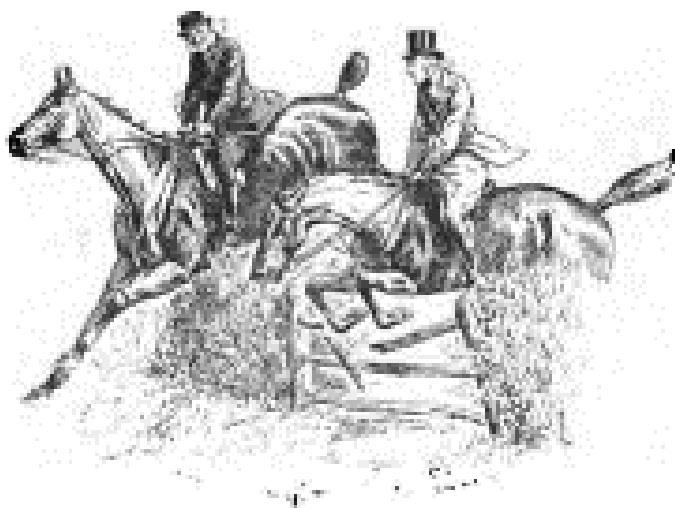
PARSON GEDDES AND SQUIRE FOLEY.

"It's ugly going, as you know, with the roots all wriggling about in the darkness, but you can take a risk when you catch an occasional glimpse of the pack running with a breast-high scent; so in and out they dodged until the wood began to thin at the edges, and they found themselves in the long bottom where the river runs. It is clear going there upon grassland, and the hounds were