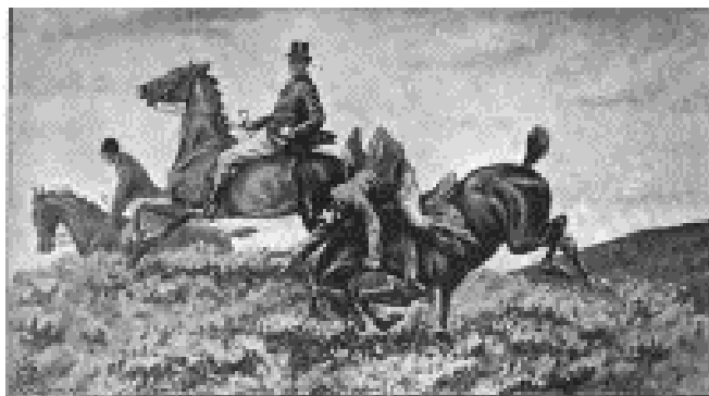
"The whips were not counted."

"There were six of them then in the front row—Parson Geddes, Squire Foley, the huntsman, two whips, and Wat Danbury, who had forgotten all about his head and the doctor by this time, and had not a thought for anything but the run. All six were galloping just as hard as they could lay hoofs to the ground. One of the whips dropped back, however, as some of the hounds were tailing off, and that brought them down to five. Then Foley's thoroughbred strained herself, as these slim-legged, dainty-fetlocked thoroughbreds will do when the going is rough, and he had to take a back seat. But the other four were still going strong, and they did four or five miles down the river flat at a rasping pace. It had been a wet winter, and the waters had been out a little time before, so there was a deal