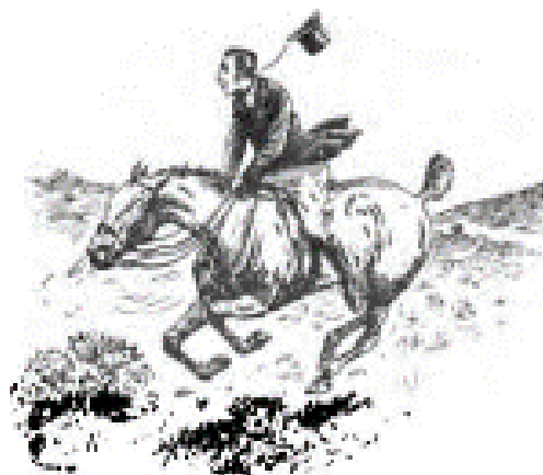
"He galloped madly over the downs."

"'I saw it all as clearly as I see you.'