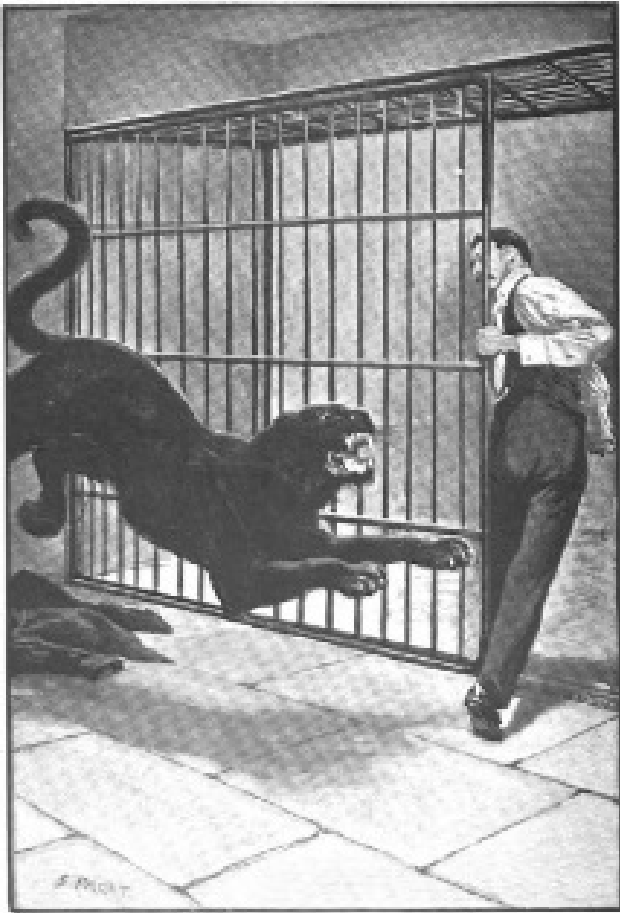
"I HURLED MYSELF THROUGH THE GAN"

edge of the grating. I heard the claws rasping as they clung to the wire netting, and the breath of the beast made me sick. But its bound had been