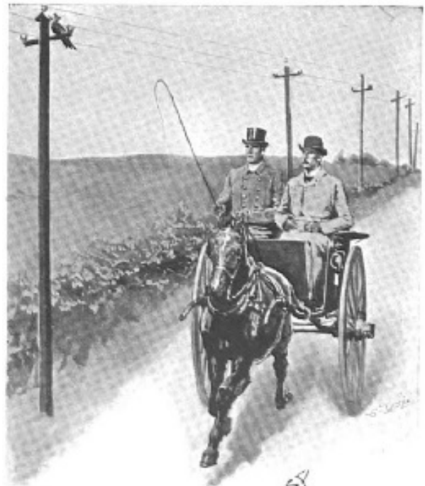
"A VERY BEAUTIFUL RIDE!"

After changing at Ipswich, a little local train deposited me at a small, deserted station lying amidst a rolling grassy country, with a sluggish and winding river curving in and out amidst the valleys, between high, silted banks, which showed we were within reach of the tide. No carriage was awaiting me (I found afterwards my telegram had been delayed), so I hired a dog-cart at the local inn. The driver, an excellent fellow, was full of my relative's praises, and I learned from him Mr. Everard King was already a name to conjure with in that part of the country. He had entertained the school-children, he had