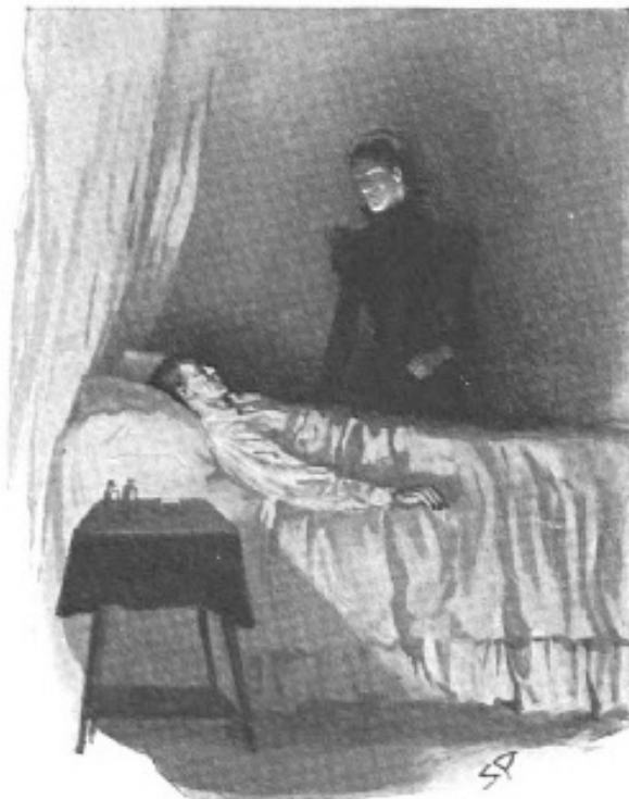
*** ARE YOU CONSCIOUS? SHE ASKED. ***

And then I heard him fall, and rise, and fall again, with a sound like the ripping of sacking. His screams grew fainter until they were lost in the worrying snarl. And then, after I thought he