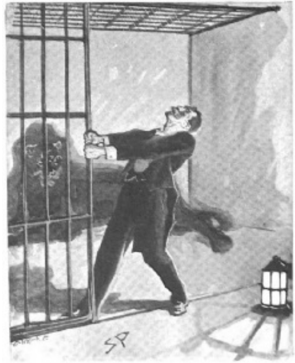
"I WAS DRAGGED ACROSS THE WHOLE FRONT OF THE CAGE."

We passed quietly down the lamp-lit Persian-rugged hall, and through the door at the farther end. All was dark in the stone corridor, but a stable lantern hung on a hook, and my host