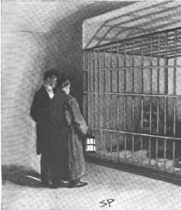
"WE SAW IT, A HUGE BLACK MAN."

It was, indeed. The wind was howling and screaming round the house, and the latticed windows I rattled and shook as if they were coming in. The glow of the yellow lamps and the