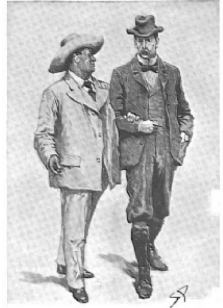
"WE WALKED UP AND DOWN."

But, in spite of his cheery good nature, he was a man with a strong will and a fiery temper of his own. Of this I had an example upon the following morning. The curious aversion which Mrs. Everard King had conceived towards me was so strong, her manner at breakfast was almost offensive. But her meaning became unmistakable when her husband had quitted the room.