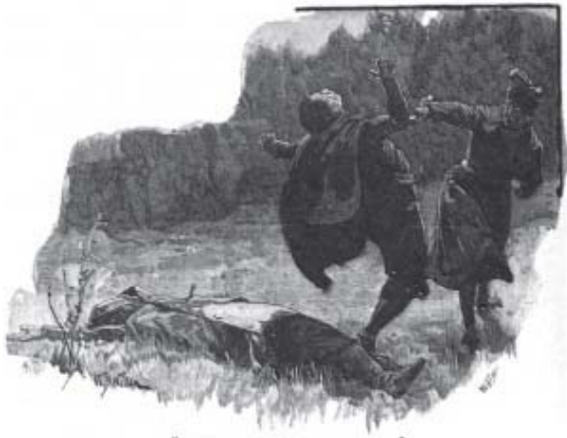
"I DROVE MY SWORD WITH FRANTIC FORCE."

My God! the horror of that moment! It is a marvel I did not drop dead myself. As in a dream, I saw the grey coat whirl convulsively round, and caught a glimpse in the moonlight of three inches of red point which jutted out from between the