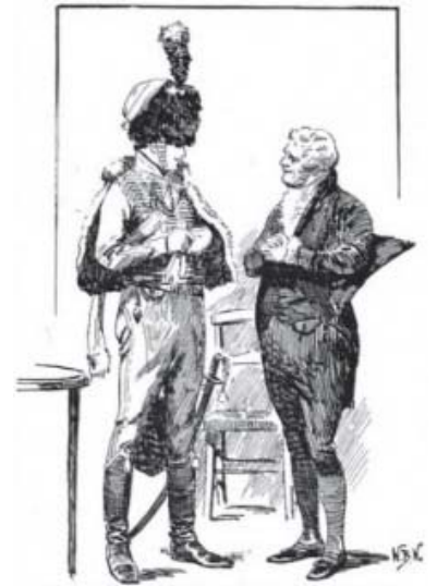
"MONSIEUR GERARD APPEARS TO BE A LITTLE PUFFED UP."

'I have heard, Colonel de Lasalle,' said he, with an icy dignity, 'your opinion is of great weight upon the subject of light cavalry. Should I have occasion to seek information about branch of the army, I shall be very happy to apply to you. At present, however, the matter concerns diplomacy, and you will permit me to form my own