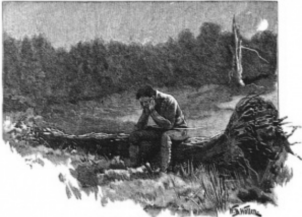
"I TRIED TO THINK WHAT HAD HAPPENED."

Abbot's Beech, and saw in the distance that gnarled stump which must ever be associated with the most terrible moment of my life. I sat down upon a fallen trunk with my sword across