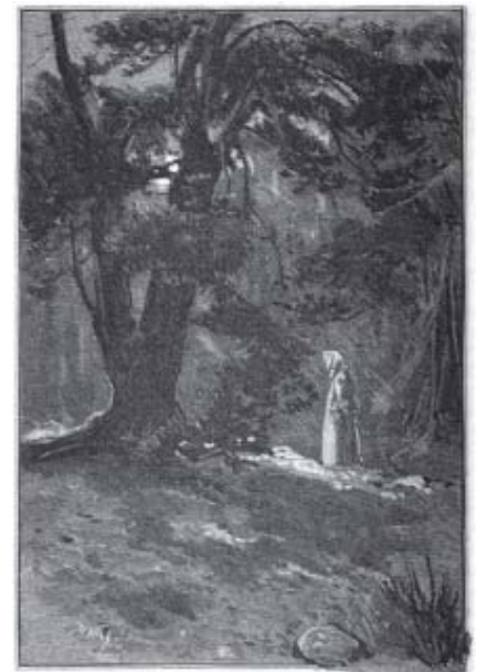
"THE EMPEROR WAS PACING UP AND DOWN."