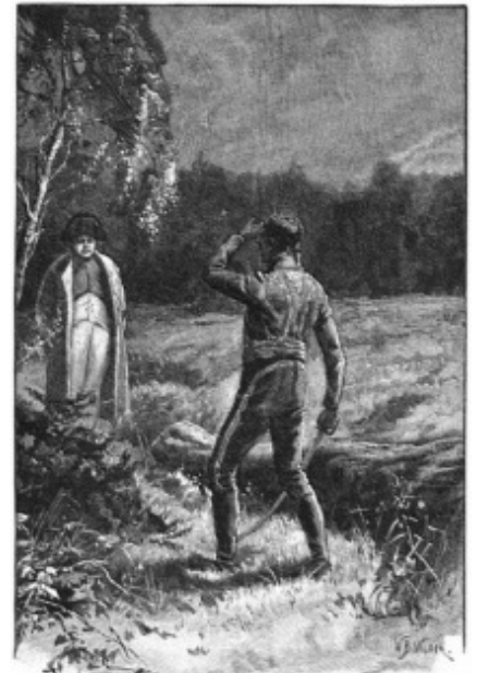
"THE EMPEROR WAS STANDING BEFORE ME!"

He was flesh and blood, then, this Emperor. I could feel the little, plump palm that rested upon me. And yet I could not get over what I had seen with my own eyes, and so I stared at him in