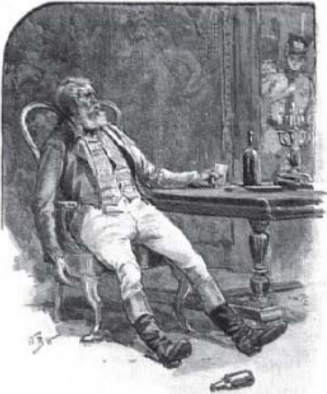
"FACING US THROUGH THE WINDOW MAN."

through a pitch-black fir-wood, where we could see nothing save the ragged patch of stars above our heads. Presently, however, it opened up, and there was the Castle right in front of us, about as far as a carbine would carry.