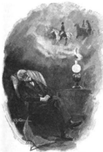
"WHEN I DOZE IN MY ARM-CHAIR, I SEE THOSE GREAT WARRIORS."

to an end, and had every hope of soon being made a General of Division, it is still rather to my earlier days that I turn when I wish to talk of the glories and the trials of a soldier's life. For you will understand that when an officer has so many men and horses under him, he has his mind full of recruits and remounts, fodder and farriers, and quarters, so that even when he is not in the face of the enemy, life is a very serious matter. But when he is only