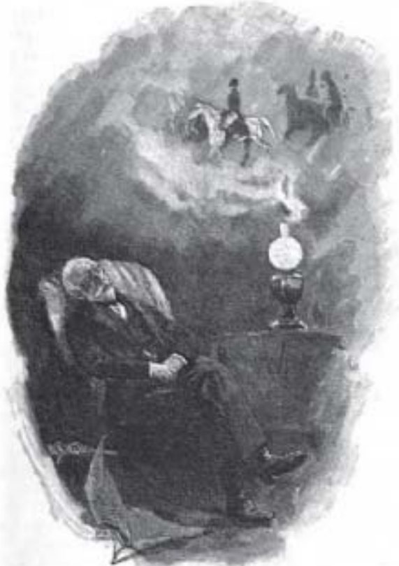
"WHEN I DOZE IN MY ARM-CHAIR, I SEE THOSE GREAT WARRIORS."

wonderful men, the men who were veterans when they were yet boys, who learned to use a sword earlier than a razor, and who during a hundred battles had never once let the enemy see the colour of their knapsacks.