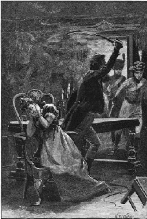
"HE GAVE A HOWL LIKE A WOLF."

As we rushed out we had to stagger through