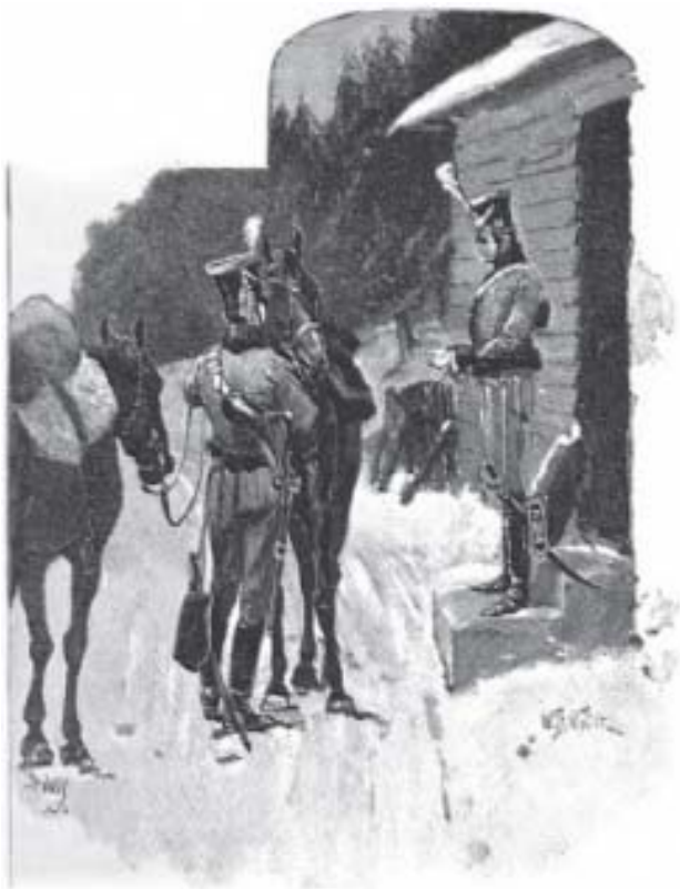
"ON THE STEPS STOOD THEIR OFFICER."

It was a bleak season to ride through the poorest and ugliest country in Europe, but there was a cloudless sky above, and a bright, cold sun, which shimmered on the huge snowfields. My breath reeked into the frosty air, and Rataplan