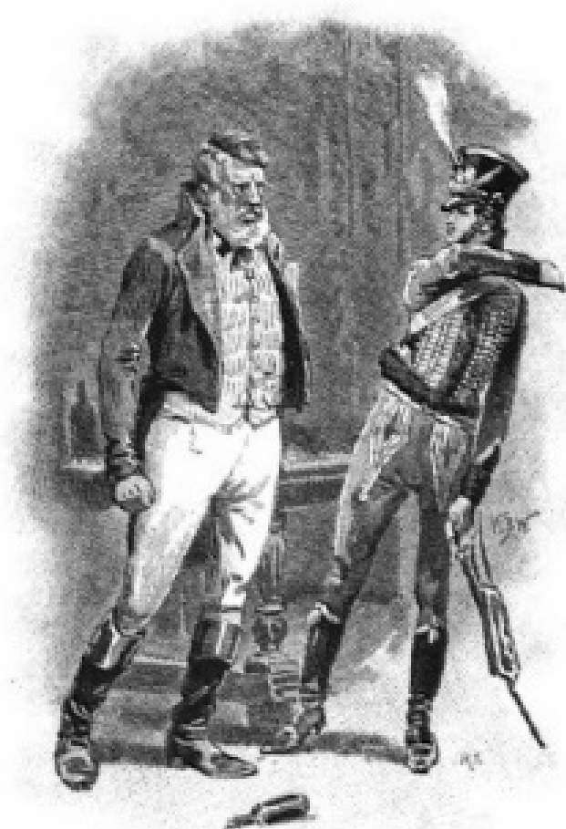
"DUROC'S PATIENCE COULD STAND NO MORE."

'Enough,' said young Duroc. 'If I were to pass my sabre through you as you sit in that