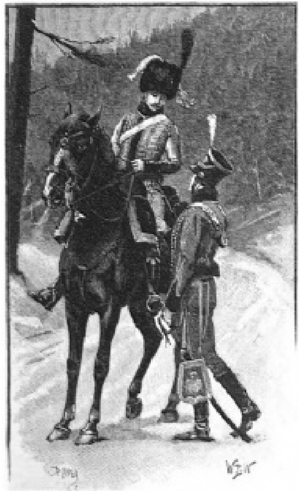
"YOUNG DUROC CAME RUNNING OUT OF THE DOOR."

'I can explain it all in a few words,' said he. 'If I have not already satisfied your very natural