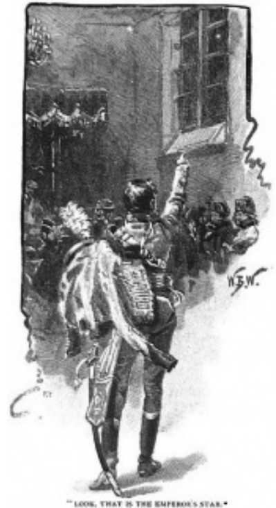
"LOOK, THAT IS THE EMPEROR'S STAR."

'You have often expressed friendship for the Emperor,' I cried. 'It is now at last that this friendship is about to be tried. If you will stand firm, he will reward you as only he can reward. It is an easy thing for him to turn a Prince into a King and a province into a power. His eyes are fixed upon you, and though you can do little to harm him, you can ruin yourself. At this moment he is crossing the Rhine with two hundred thousand men. Every fortress in the country is in his hands. He will be upon you in a week, and if