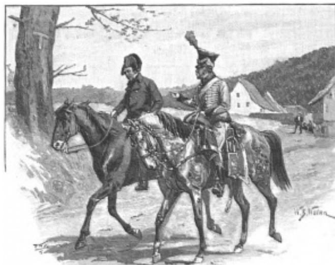
"CAN YOU TELL ME WHAT THIS LETTER T IS?"

I was turning this over in my head and wondering what their boorish conduct could mean, when I saw, as I rode from the village, a great T new carved upon a tree. I had already