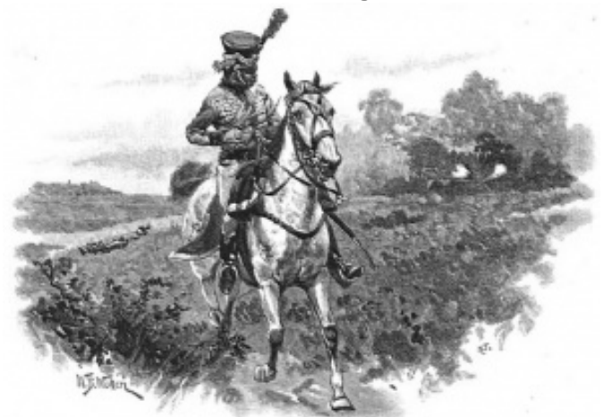
"A BULLET HUMMED FAST ME LIKE A BEE."

The heavy-cheeked landlord was there and his flaxen-haired wife, the two men from the stables, a chambermaid, and two or three villagers. All of them, women and men, were flushed and angry, while there in the centre of them, with pale cheeks and terror in her eyes, stood the loveliest woman that ever a soldier would wish to look upon. With her queenly head thrown back, and a touch of defiance mingled with her fear, she looked as she gazed round her