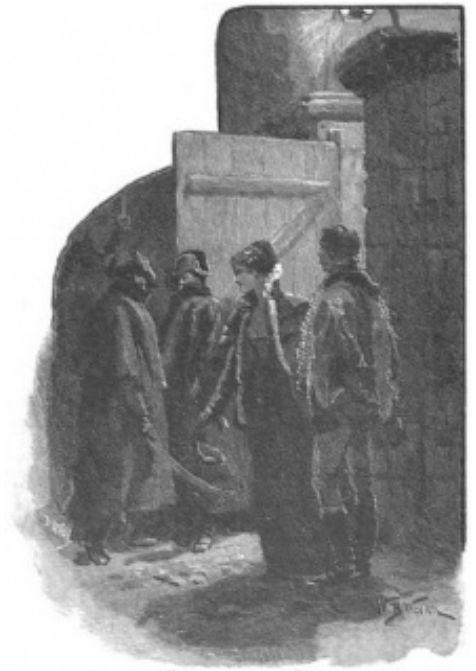
"THIS MAN IS MINE."

'Colonel Gerard,' said she, 'we have been playing a game, you and I, and the stake was a heavy one. You have shown by delivering a