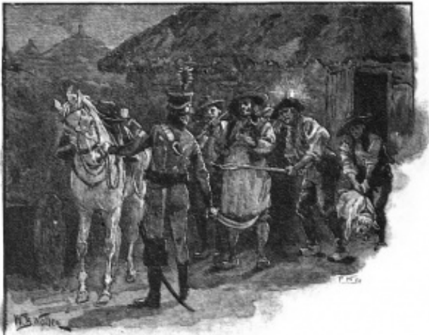
"RIDE AWAY, SIR, RIDE AWAY!"

Not only was she gone, but her cap and silver-mounted riding switch which had lain upon the table were gone also. I rushed out and roared for the landlord. He knew nothing of the matter, had never seen the woman before, and did not care if he never saw her again. Had the peasants at the door seen anyone ride away? No, they had seen nobody. I searched here and searched there, until at last I chanced to find myself in front of a mirror, where I stood with