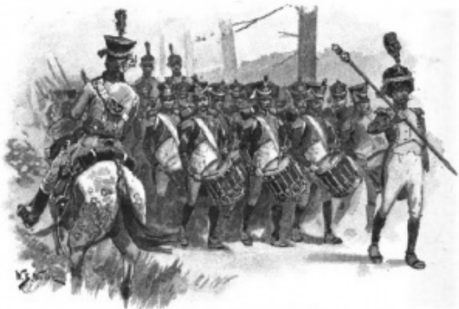
"LONG COLUMNS WOULD BRING PAST ME."

to draw into the ditch continually as the Coburg sheep and the Bavarian bullocks came streaming past with wagon loads of Berlin beer and good French cognac. Sometimes, too, I would hear the