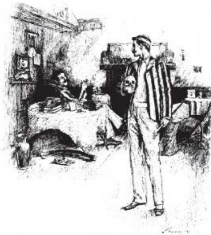
"GOOD-BYE, MY SON, AND TAKE MY TIP AS TO YOUR NEIGHBOUR."

"Not I. I'm supposed to be in training. Here I've been sitting gossiping when I ought to have been safely tucked up. I'll borrow your skull, if