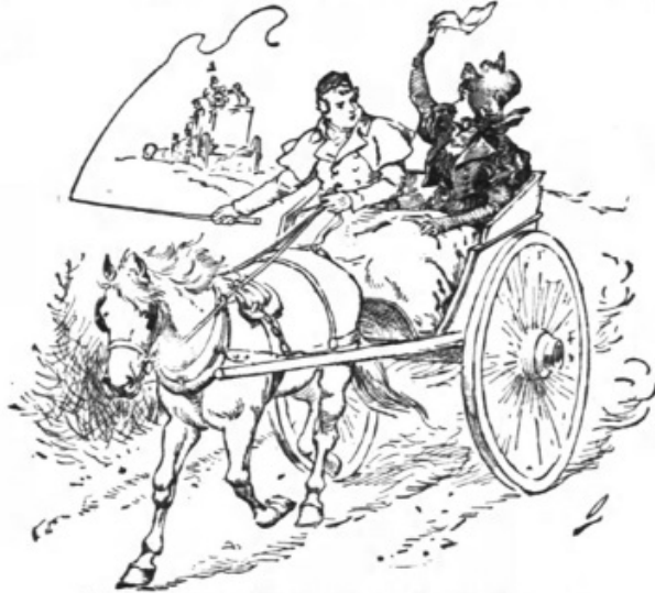
SUDDENLY SHE SHOOK HER HANDKERCHIEF IN THE AIR.

"He's left a' his savings to his lassie," said