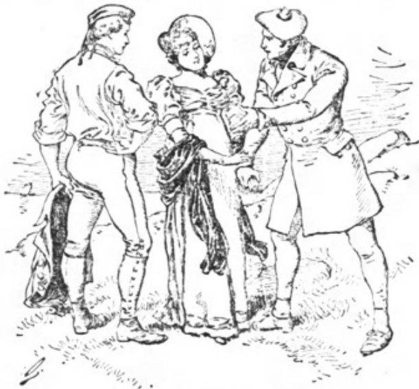
"COME, WHICH SHALL IT BE?"

You would have thought that the woman would have been overwhelmed with shame, but instead of that her eyes were shining with delight; and I dare wager that it was the