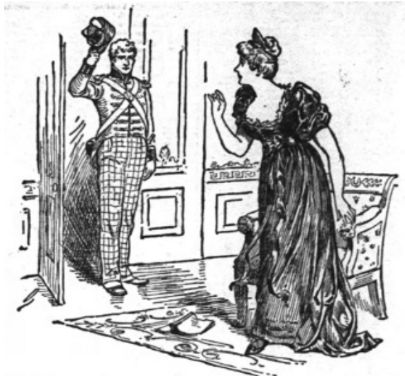
"FOR A MOMENT SHE DID NOT RECOGNIZE ME."

I had always been brought up during all these years to look upon the French as very evil folk, and as we only heard of them in connection with fightings and slaughterings, by land and by sea, it was natural enough to think that they were vicious by nature and ill to meet with. But then, after all, they had only heard of us in the same fashion, and so, no doubt, they had just the same idea of us. But when we came to go through their country, and to see their bonny little steadings, and the douce quiet folk at work in the fields, and the women knitting by the roadside, and the old granny with a big white